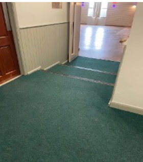
New Carpet in Entrance